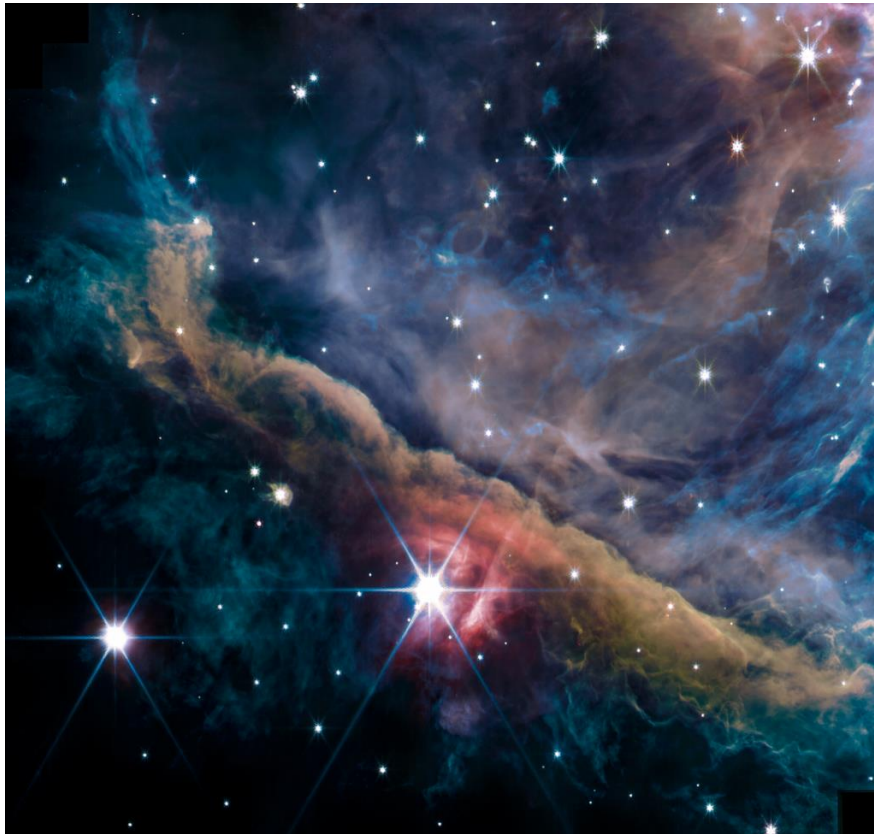
Image of the inner region of the Orion Nebula obtained by the James Webb Space Telescope

This is a composite image from several filters showing the infrared radiation of ionised gas, hydrocarbons, molecular gas, dust and scattered starlight. The Orion Bar, a dense wall of gas and dust extending from the upper left to the lower right of the image, contains the most visible bright star, \theta 2 Orionis A. The view is illuminated by a cluster of hot young massive stars called the Trapezium Cluster, seen here at the far top right of the image. The cluster's powerful, intense ultraviolet radiation creates a hot ionised environment in the upper right section, which is slowly eroding the Orion Bar. The molecules and dust can survive longer in the dense shielded environment offered by the Orion Bar, but the energy from the stars carves out a region that displays an incredible wealth of filaments, globules, young stars with disks and cavities.